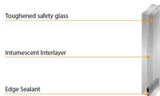
EW 120 fire rated glass

Range of application: internal and external.